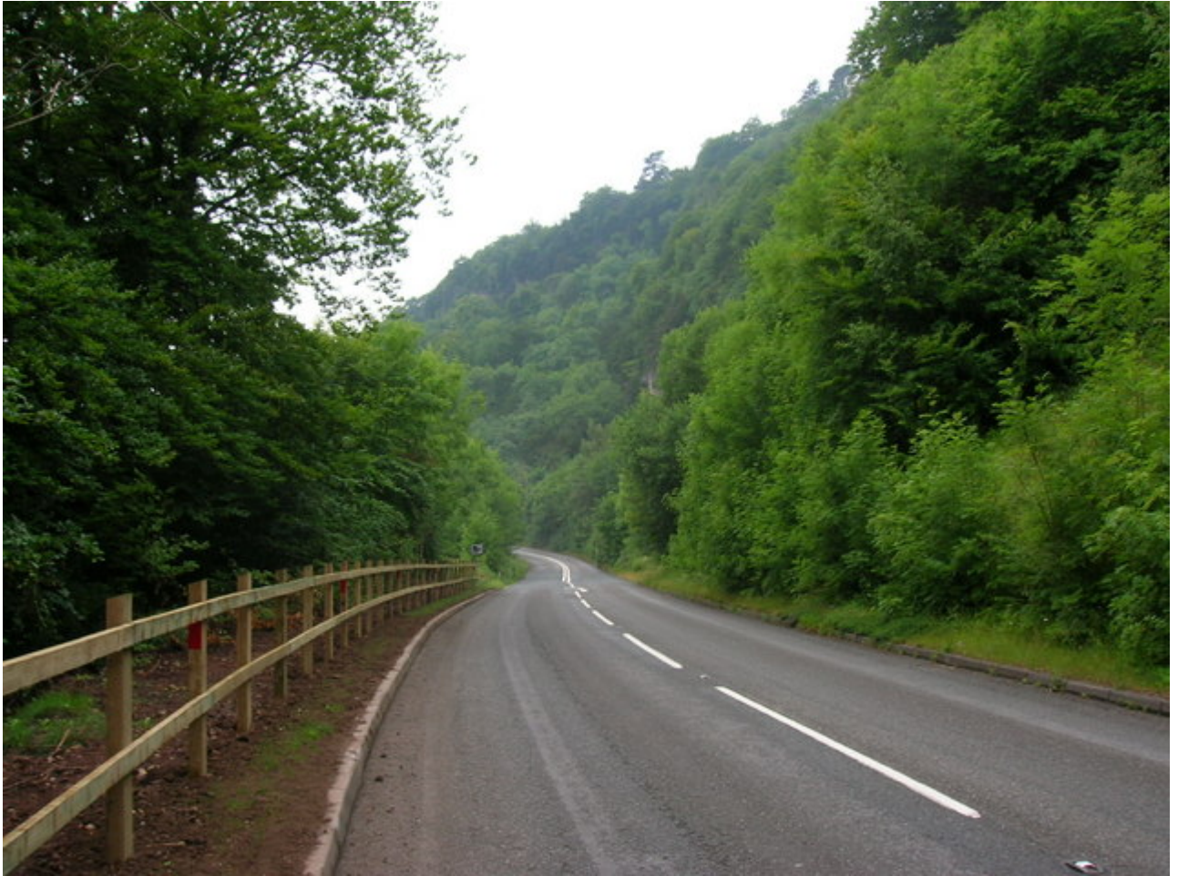
Descending the Wye Valley on the A466 towards Tintern.